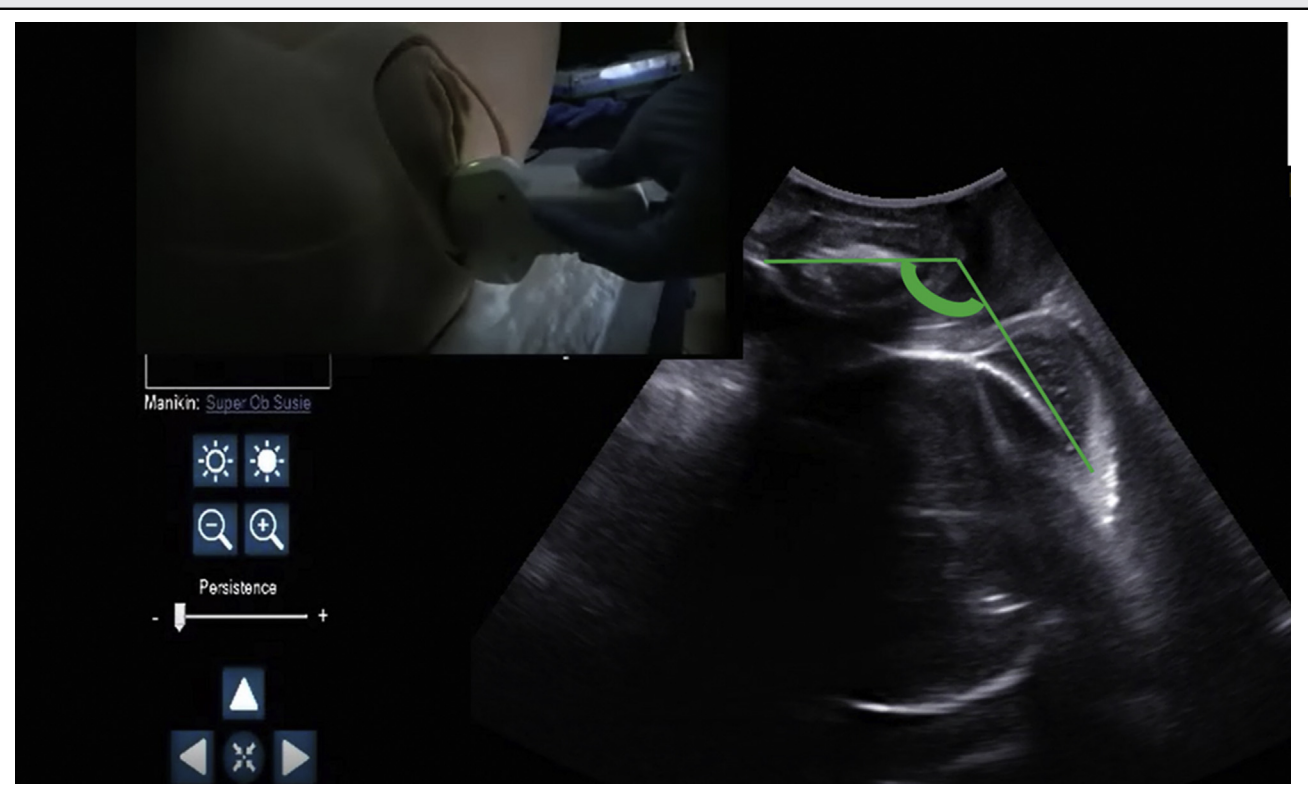
Ghi T, Rizzo G, on behalf of the EGEO Group. The use of a hybrid mannequin for the modern high-fidelity simulation in the labor ward: the Italian experience of the Ecografia Gestione Emergenze Ostetriche (EGEO) group. Am J Obstet Gynecol 2020.

Measurement of the angle of progression on the sagittal plane